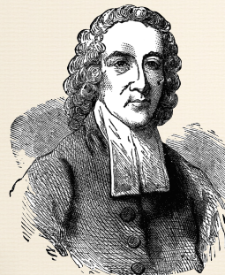
The Works of Jonathan Edwards p 465

"The relationship of the Old Testament Law and the New Testament Gospel of grace is controversial even among devout Christians."